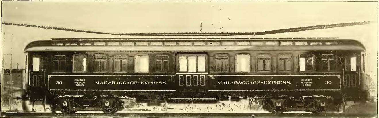
BAGGAGE CAR FOR COLUMBUS, DELAWARE & MARION RAILWAY

Several changes have been made in the form and construction of the Morehead trap, illustrated herewith. A cast-iron base has been substituted for the wooden platform previously used. The drum or tank is now counter balanced by a lever and